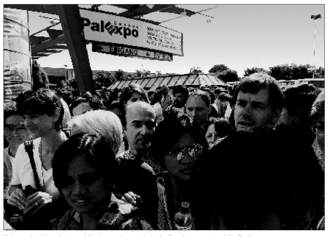
Delegates head into the Arena Monday morning to take in the first plenary session of the Conference.

Can we now prevent children from being born with HIV?